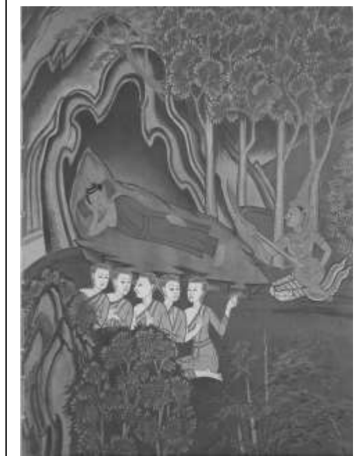
Fig 13.2.2. The lesson of the 3 strings. Sakra plays a 3-stringed phin (Siamese vīṇā ), watched by the 5 monks. Wat Rajasiddharam, Dhonburi. (Picture 19, The Life of the Buddha according to Thai temple paintings , USIS, 1959.)

Thereupon, the group of 5, disappointed with the Bodhisattva, each taking his almsbowl and robes, left. They walked a distance of 18 yojanas and reached the deer park at Isipatana, where they practised on their own. 615